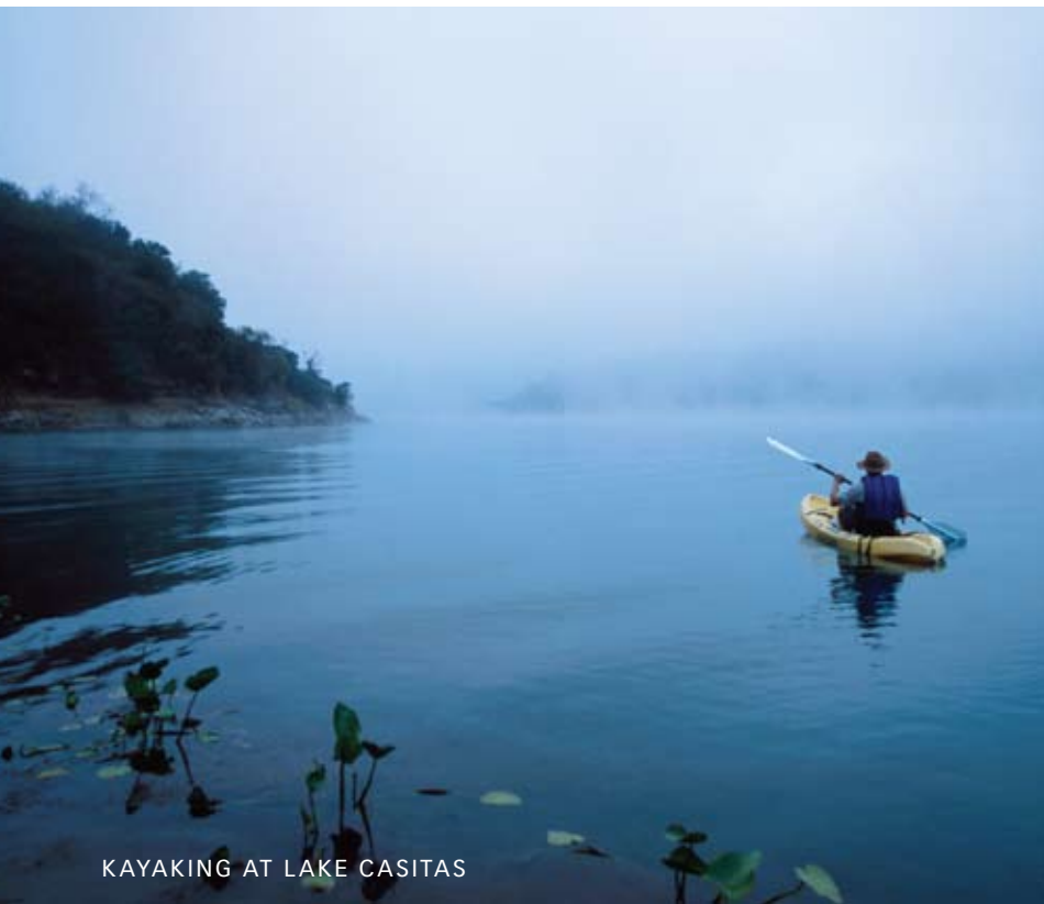
KAYAKING AT LAKE CASITAS