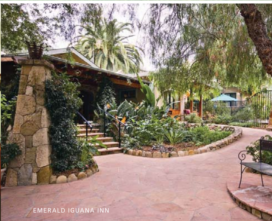
EMERALD IGUANA INN