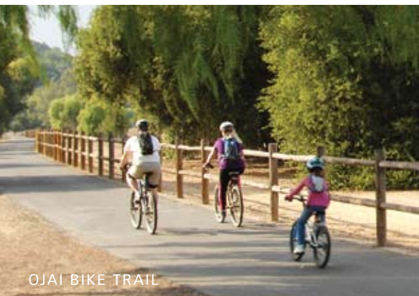
OJAI BIKE TRAIL