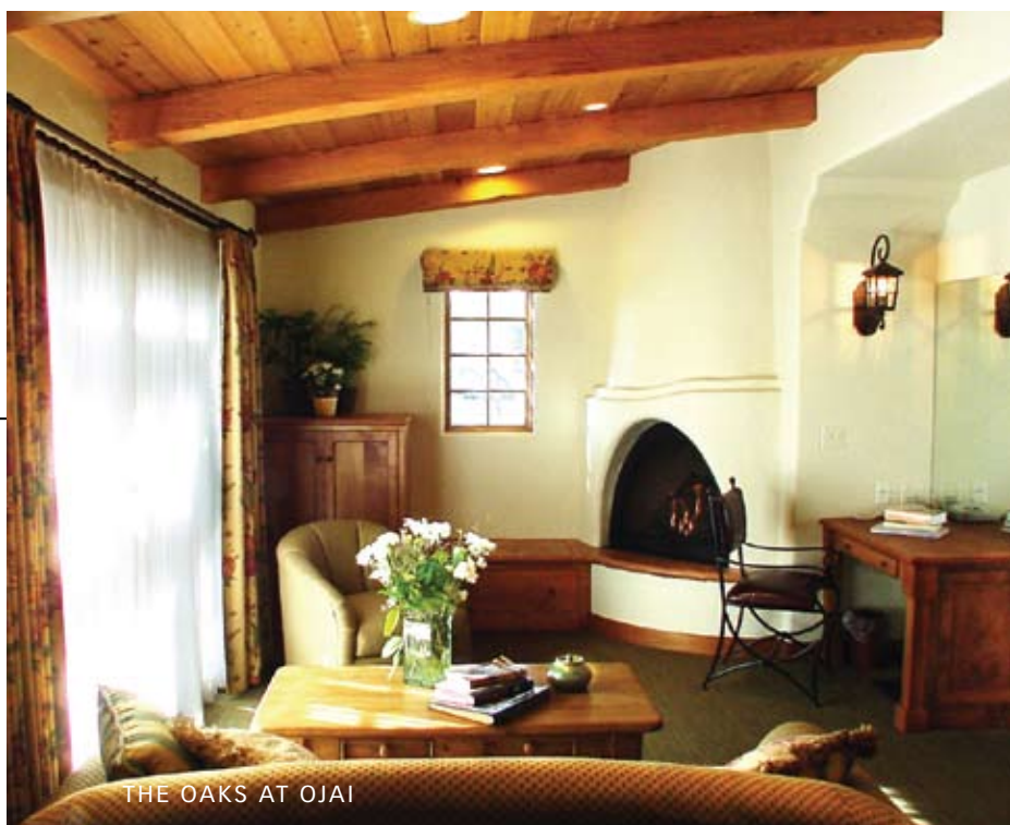
THE OAKS AT OJAI