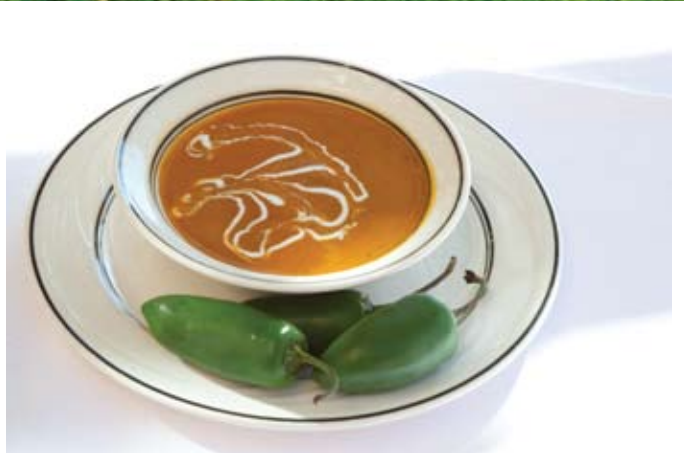
CHILE PUMPKIN SOUP, THE OAKS AT OJAI