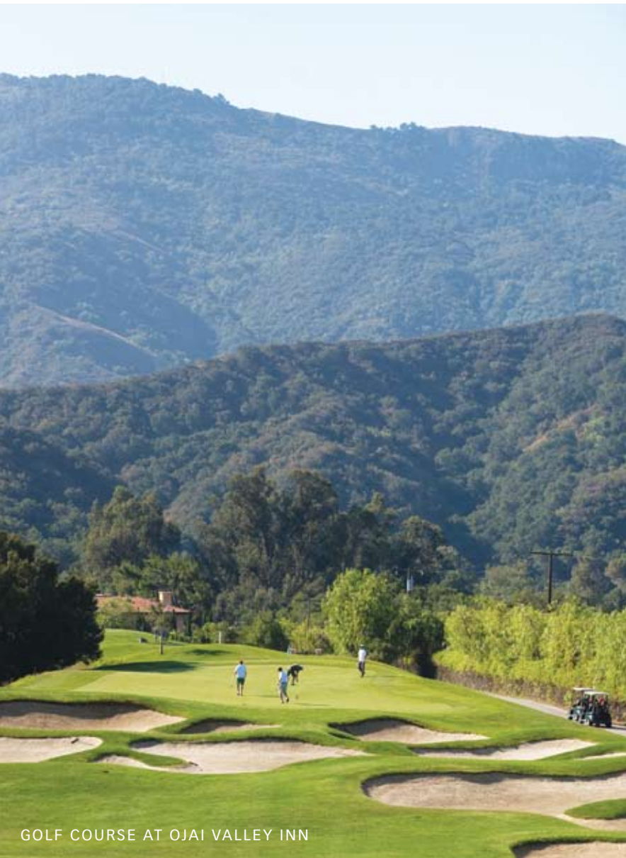
GOLF COURSE AT OJAI VALLEY INN