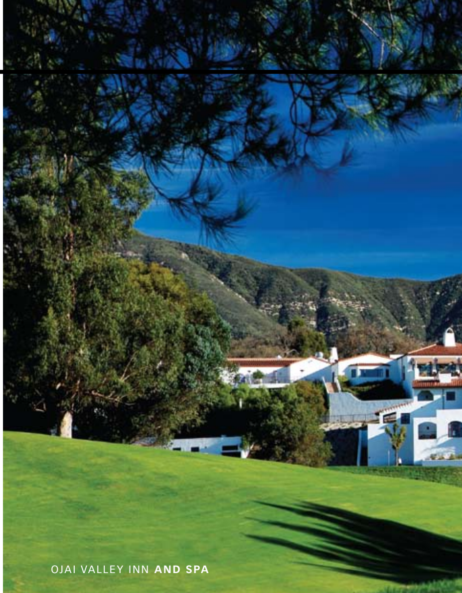
OJAI VALLEY INN AND SPA