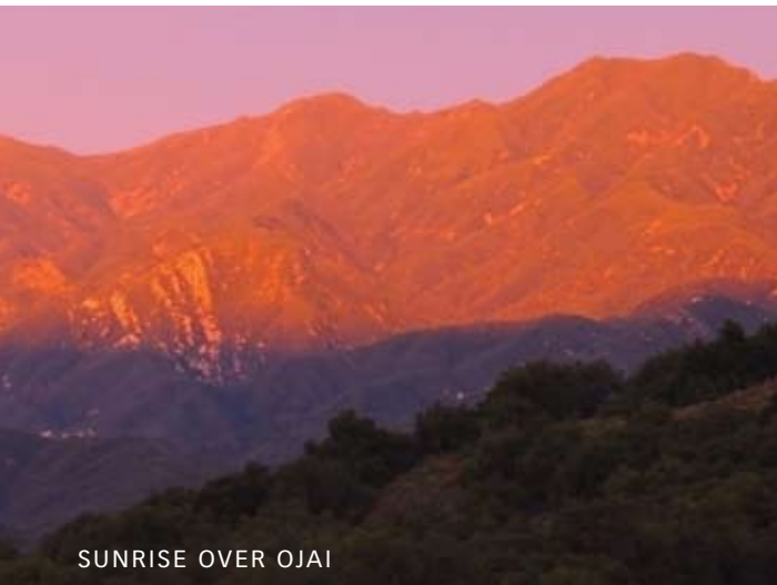
SUNRISE OVER OJAI